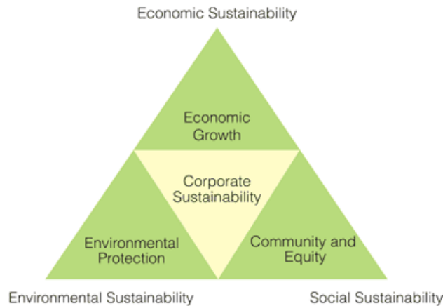
Figure 1 – Corporate sustainability in line with the Triple Bottom Line approach.

For the elaboration of the directives presented in this document, the focus was directed towards the environmental and social dimensions located at the base of the sustainability pyramid, by virtue of the fact that the economic dimension has traditionally permeated the actions of the company.